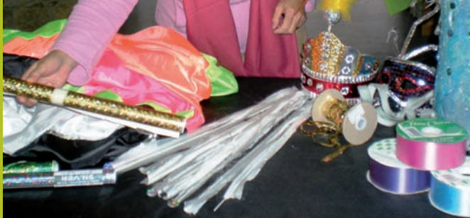
Table Top Costume Sale